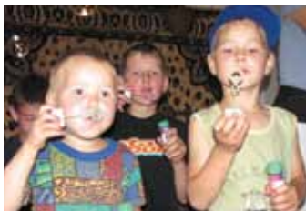
A birthday party!

I used to cry at first, after my husband abandoned us. It was almost a year ago. Now I am stronger. He visits the children and gives us some money, but we miss his presence and care. It is so hard to know he is not here when we need him. I believe that my husband will come back to us one day. We are all praying for him to repent. I remember Job, who was blessed with twice as much as he had before his tribulations. I believe that my trials will end one day and that God will give me a strong and happy