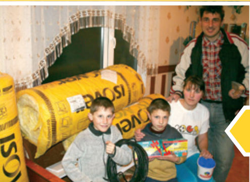
Renovations have improved their humble home