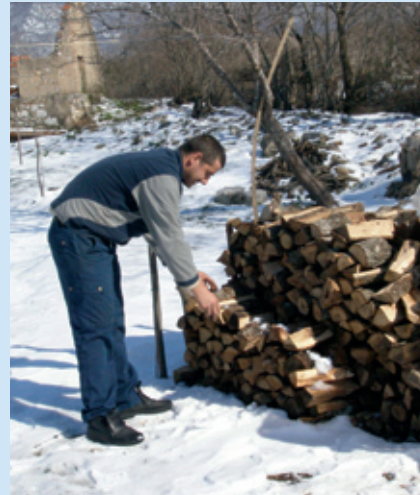
The prized new firewood from MWB