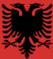
The Albanian Flag

Thirty pieces of wood... One act of kindness... One thankful heart... Our God glorified! Friends, it's worth it all! Thank you for sending a gift of support this month – for His work and His glory!