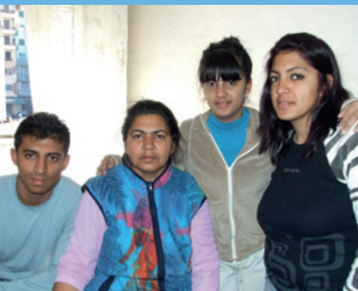
The Uku family transformed by their new faith and MWB's assistance