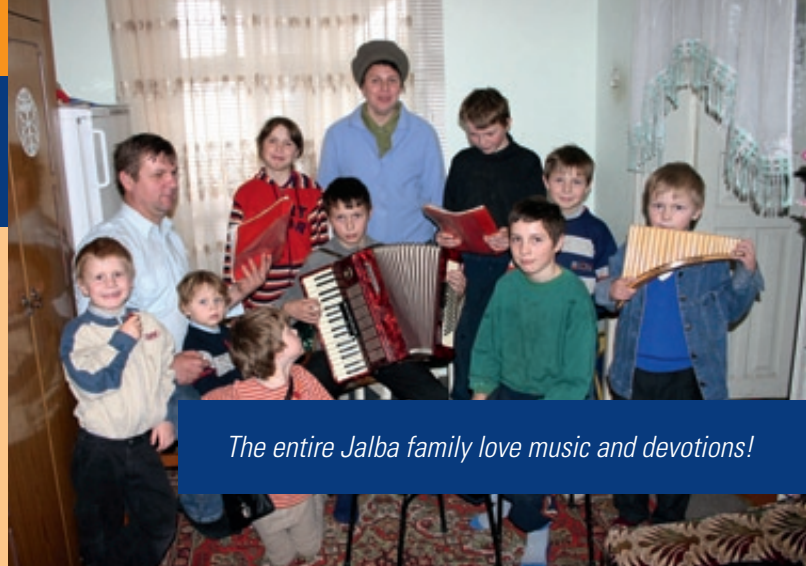
The entire Jalba family love music and devotions!

Children, families and the elderly with poor health and disabilities struggle tremendously in Eastern Europe. Medical assistance is either hard to find or impossible to afford. What if you are a large family and most of your family members struggle with illness?