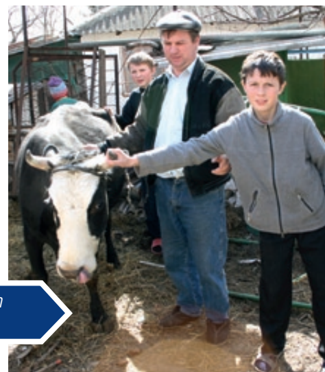
A cow now provides good nutrition for the family

Regardless, there is so much joy in this family as some of the family members are now better and they no longer need to spend almost their entire income on their medical and surgical needs. Knowing the sum total of the family's medical needs, it is obvious where their small income goes. Health insurance is costly; as are the constant medication and operations they are prescribed. "The fact that we are beneficiaries and participants in Mission Without Border's Family-to-Family program has literally saved our lives! The Coordinator always