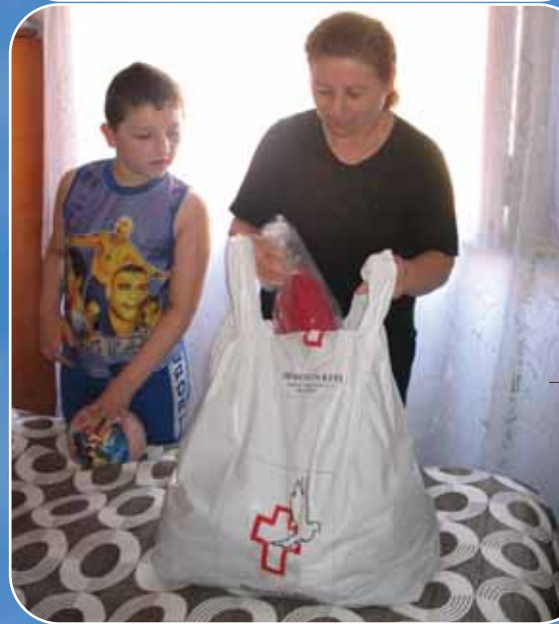
Mental illness plagues both parents and they therefore are reliant on our emotional and material support.

families through MWB's Family-to-Family program, please contact us. We have families waiting right now for Sponsorship (check out our website for a sample) and there are many other families on the doorsteps of our field country offices daily hoping that they too can enroll in the F2F program... they just need our help!