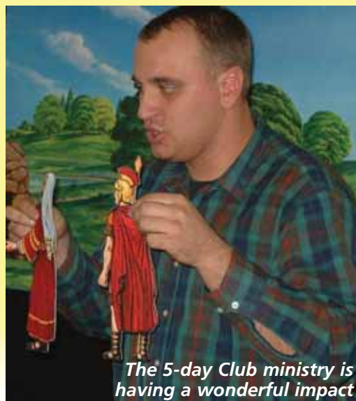
The 5-day Club ministry is having a wonderful impact

message from the Directors of the Homes was "Thank you! We simply could not do it without you! Our governments do not care about our children and do not provide the funds we need! We are simply forgotten! We need your continuous help! Thank you for everything you have done so far! Let us show you the results of our partnership so far and then we would love to show you how we need your comprehensive