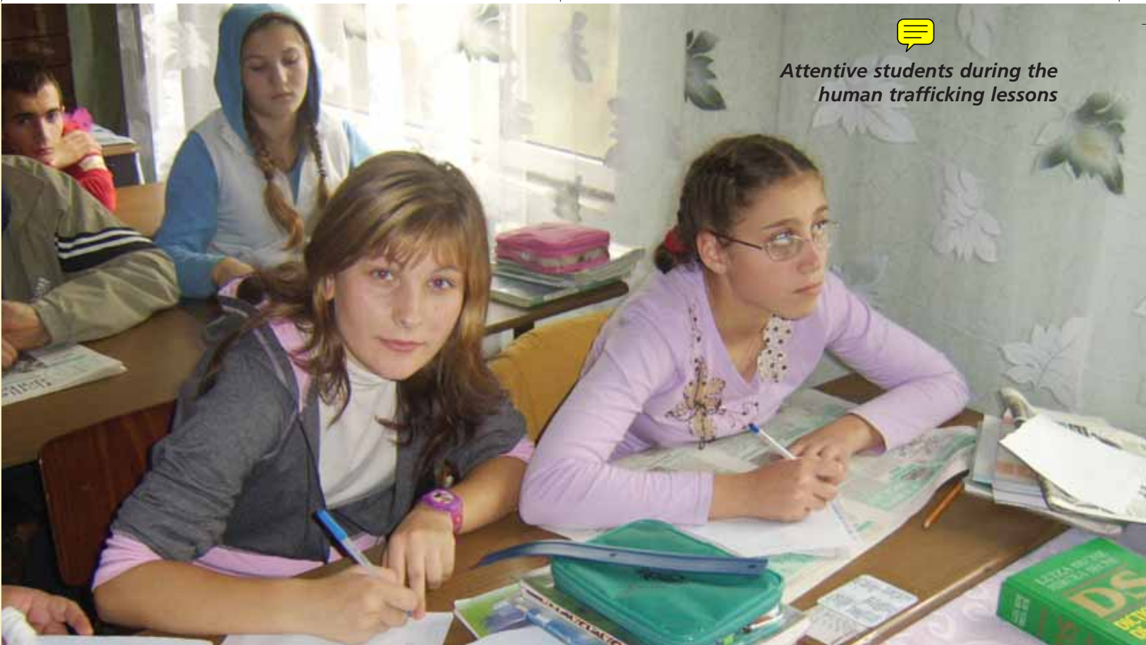
Attentive students during the human trafficking lessons