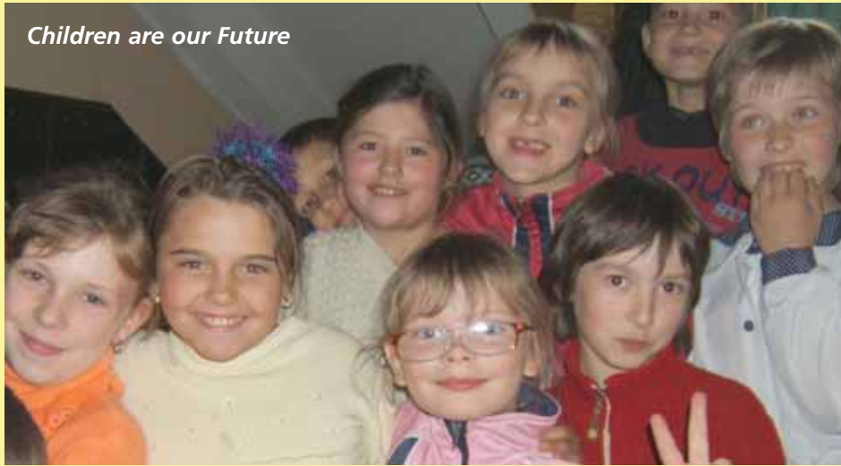
Children are our Future

concept of God, but the course produces wonderful results of encouraging the kids to open up, share and learn.