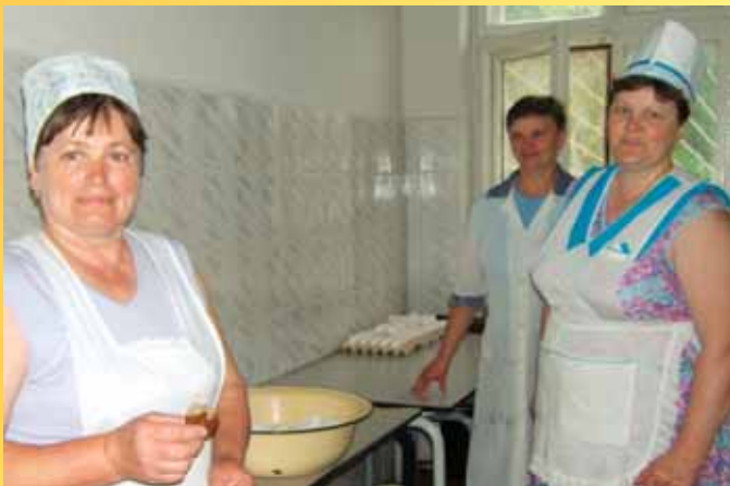
the Home staff are thankful for all donations

Contact us if you are interested in Child Sponsorship:(02) 9793 8100 Email: australia@mwbi.org Or alternatively, fill in the coupon overleaf, or visit our website (WWW.MWB.ORG.AU) for children waiting for Sponsorship now! ■