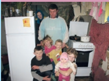
The Bunechko family with their miracles