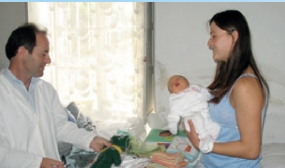
Mother Care blessing in Albania