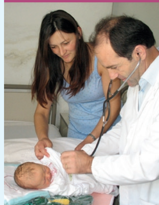
The Mother Care Program in Maminas, Albania has reduced the infant mortality rate to 0%

harm than good. Mission Without Borders responded to this need and desperate situation by establishing our successful Mother Care and Baby Care programs in Albania. The Maminas Health Clinic is one place that has seen its infant mortality rate dramatically reduce to 0%, thanks to Mother Care and Baby Care, and its success is now well-known throughout the area. Despite its regional locality, it is now well known that you are far safer to deliver your babies in this small clinic rather than brave the facilities in the larger cities. ►